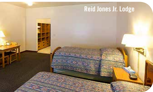
Reid Jones Jr. Lodge

The majority of our guests are housed in hotel-style lodges that accommodate up to four guests per room. The larger Reid Jones Jr. Lodge has 38 rooms, each with one full bed, two twin beds and a trundle bed – an accompanying suite has three queen beds. The Hepler-Jamison Lodge has 15 rooms, each with two twin beds and one set of bunk beds – an accompanying suite has two double beds and a sofa sleeper, and one additional room has one twin and one full bed.