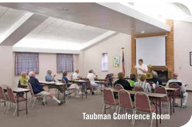
Taubman Conference Room

Additional Center Facilities – Willard Amphitheatre, John G. Rocovich, Jr. Regional Shooting Sports Complex , and the Friendship Retirement Community Wellness Center .