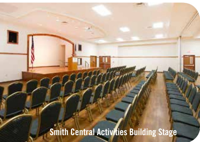
Smith Central Activities Building Stage