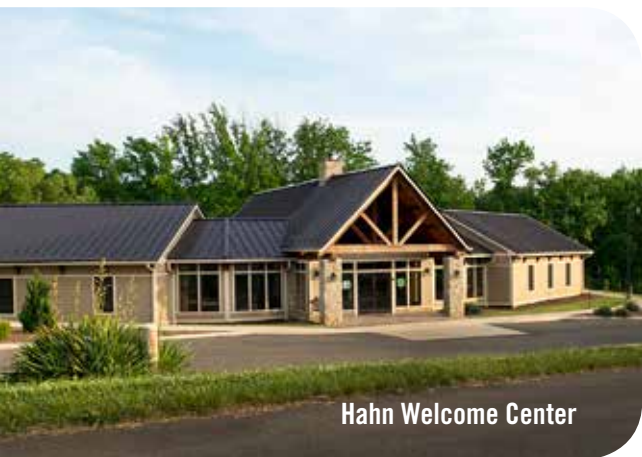
Hahn Welcome Center

Looking for a change of pace? A unique place to get away from the hustle and bustle? Are you ready to experience a productive and focused event? Look no further than the Skelton 4-H Educational Conference Center at Smith Mountain Lake in Franklin County, Virginia.